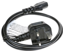
For UK, order: IEC-2M-UK