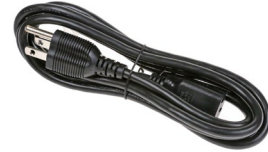
For US, order: IEC-1.8M-US