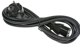
For EU, order: IEC-1.8M-EU