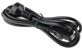
For AU/NZ, order: IEC-2M-AU-NZ