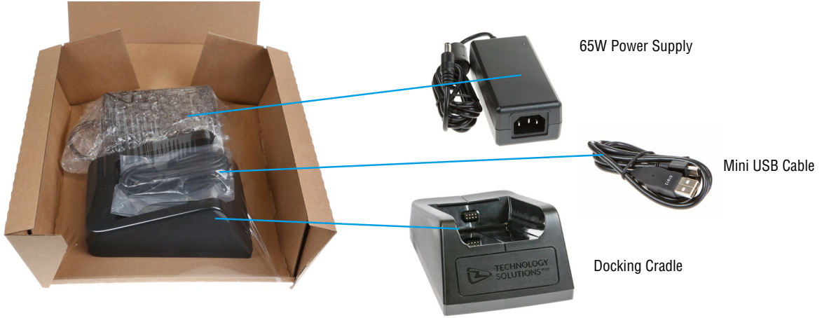
65W Power Supply