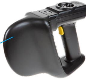
2128L UHF RFID Reader