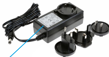
World Traveller Power Supply