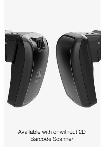
Available with or without 2D Barcode Scanner