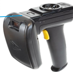
2128P UHF RFID Reader