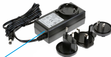
World Traveller Power Supply