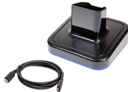
3138 Docking Cradle Kit, for use with '8-Way Power Pins' variants

TSL Reader Configuration www.tsl.com/apps/tsl-reader-configuration