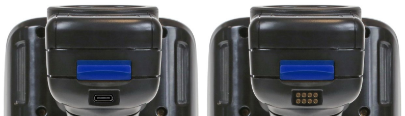
USB-C connector option