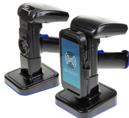
Charge the 3138 Reader and host device (via ePop-Loq® mounts)